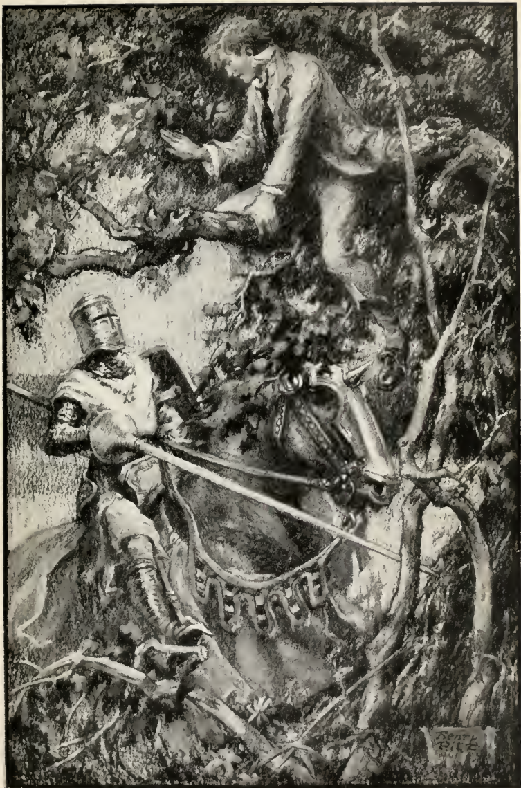
I SAW HE MEANT BUSINESS, SO I WAS UP THE TREE WHEN HE ARRIVED